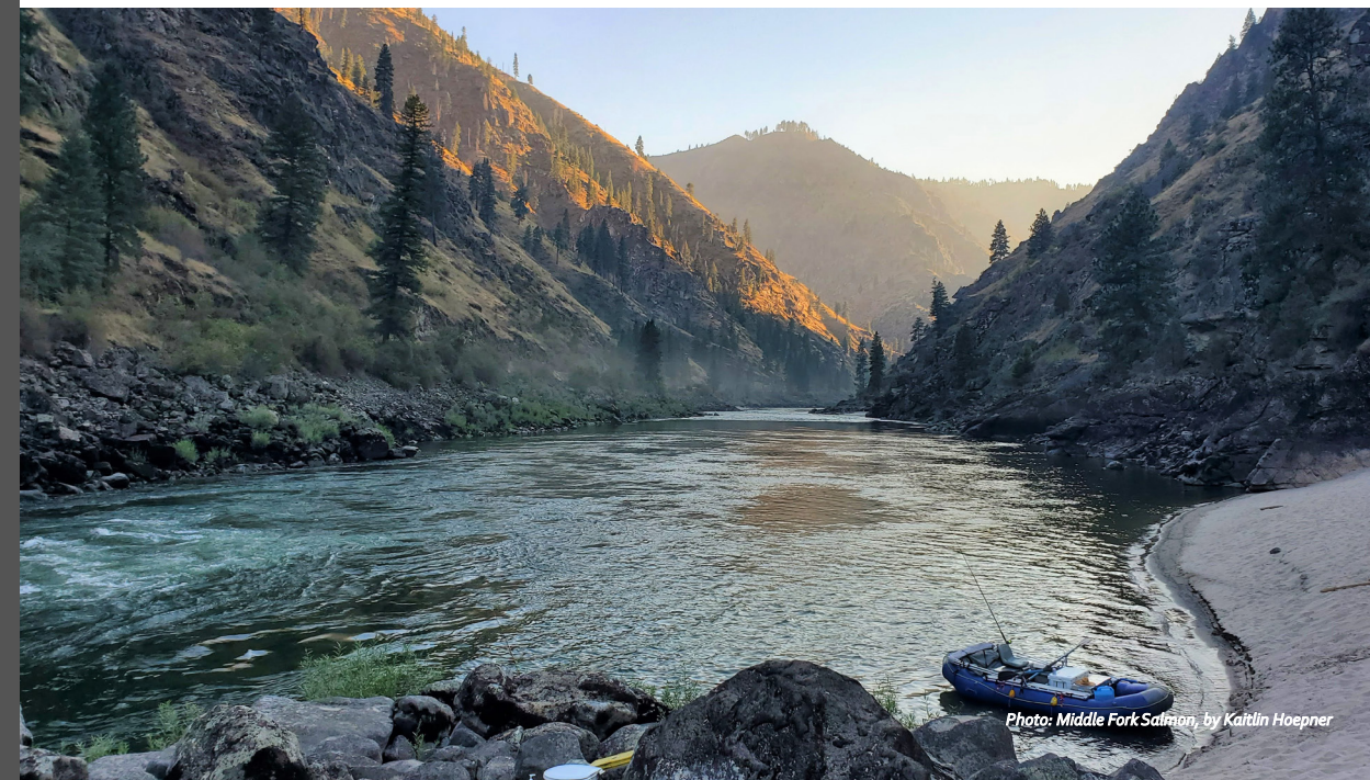
Photo: Middle Fork Salmon